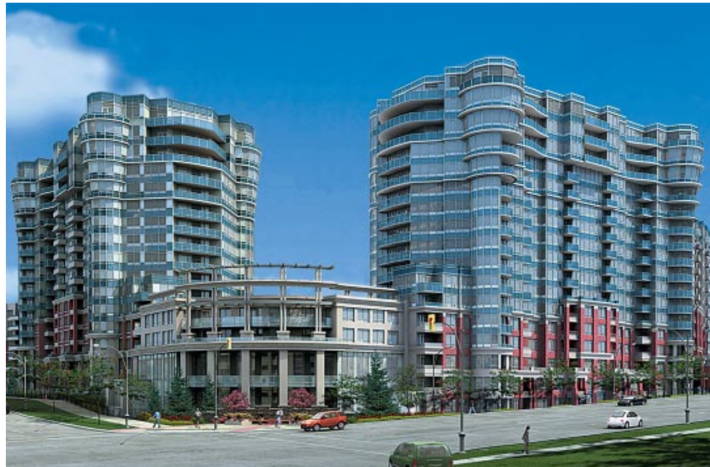
Circa Tower 1 & 2